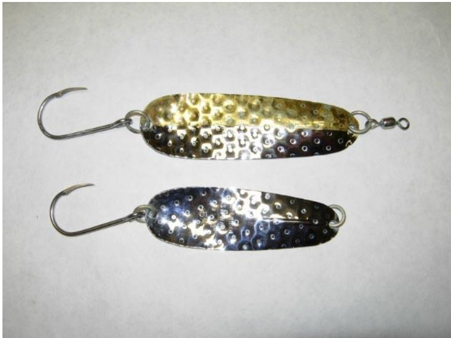
Dimpled or “Hammered” Spoons

Summary: Have a couple of spoons in the tackle kit and fish them when the currents are running strong.