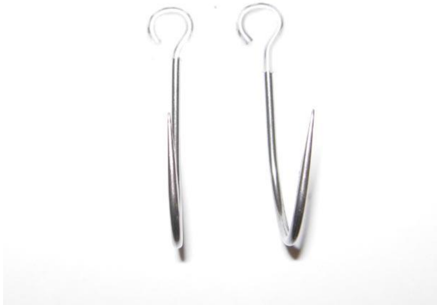
Mustad Siwash Hooks Normal (left) and Offset (right, exaggerated)

Summary: Next summer I’ll bend my Mustad Siwash hooks (on spoons and plugs) into an offset claw shape.