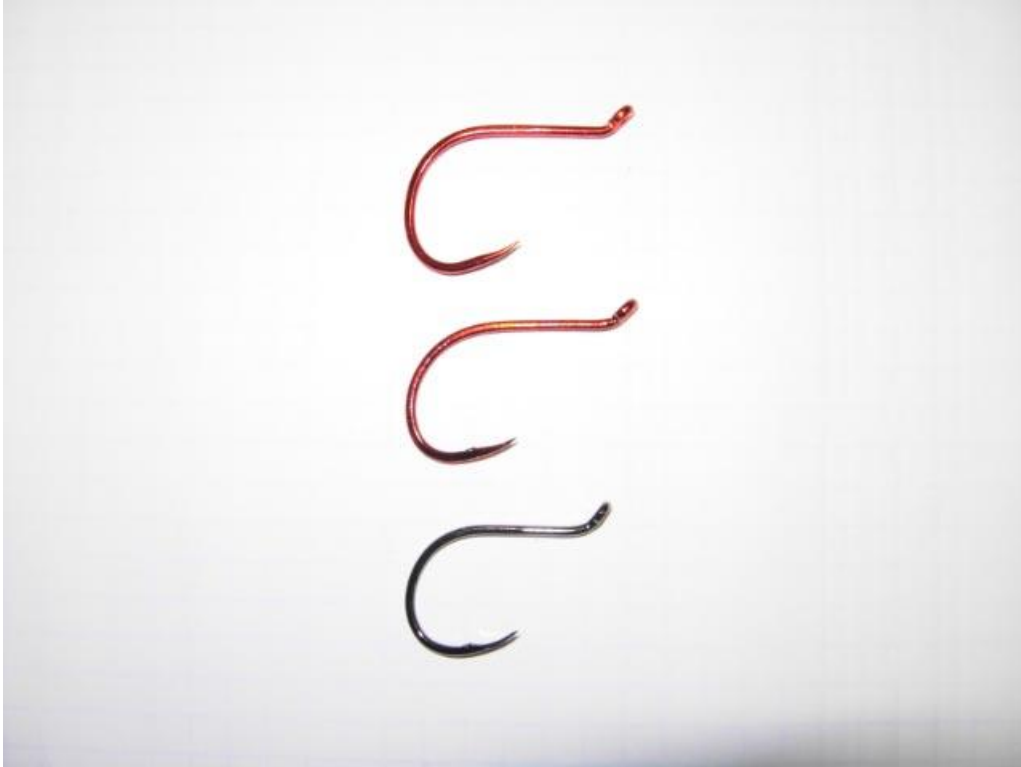
5/0 Mustad (top), Gamakatsu, and DNE (bottom)