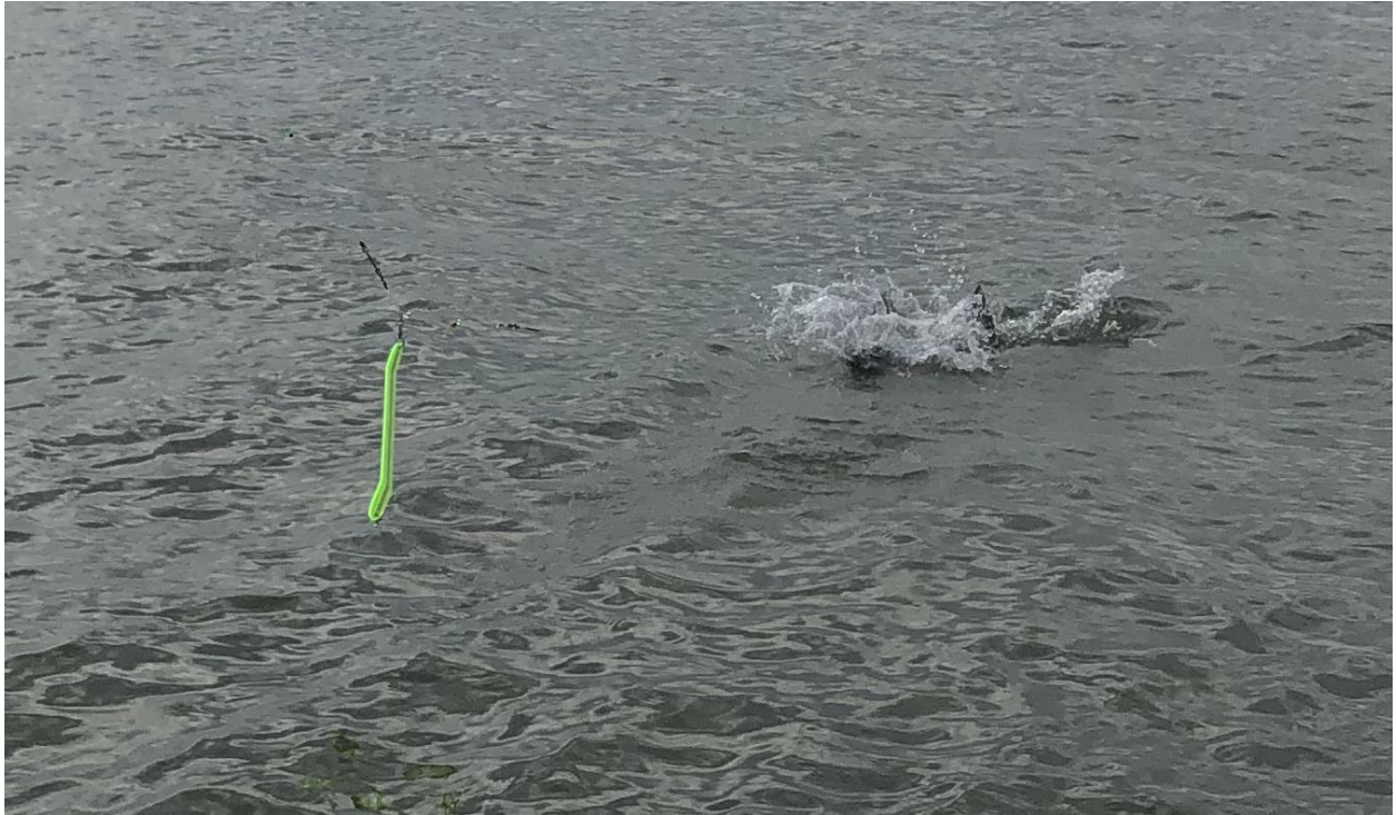
Breakaway Flasher in Action

I've tried several commercially available breakaway rigs (and the Gibbs Farr Better flashers work very well) but my preference is to modify existing flashers. This gives me more choice in flashers and also allows me to use my favourite flashers (i.e. the ones that catch fish).